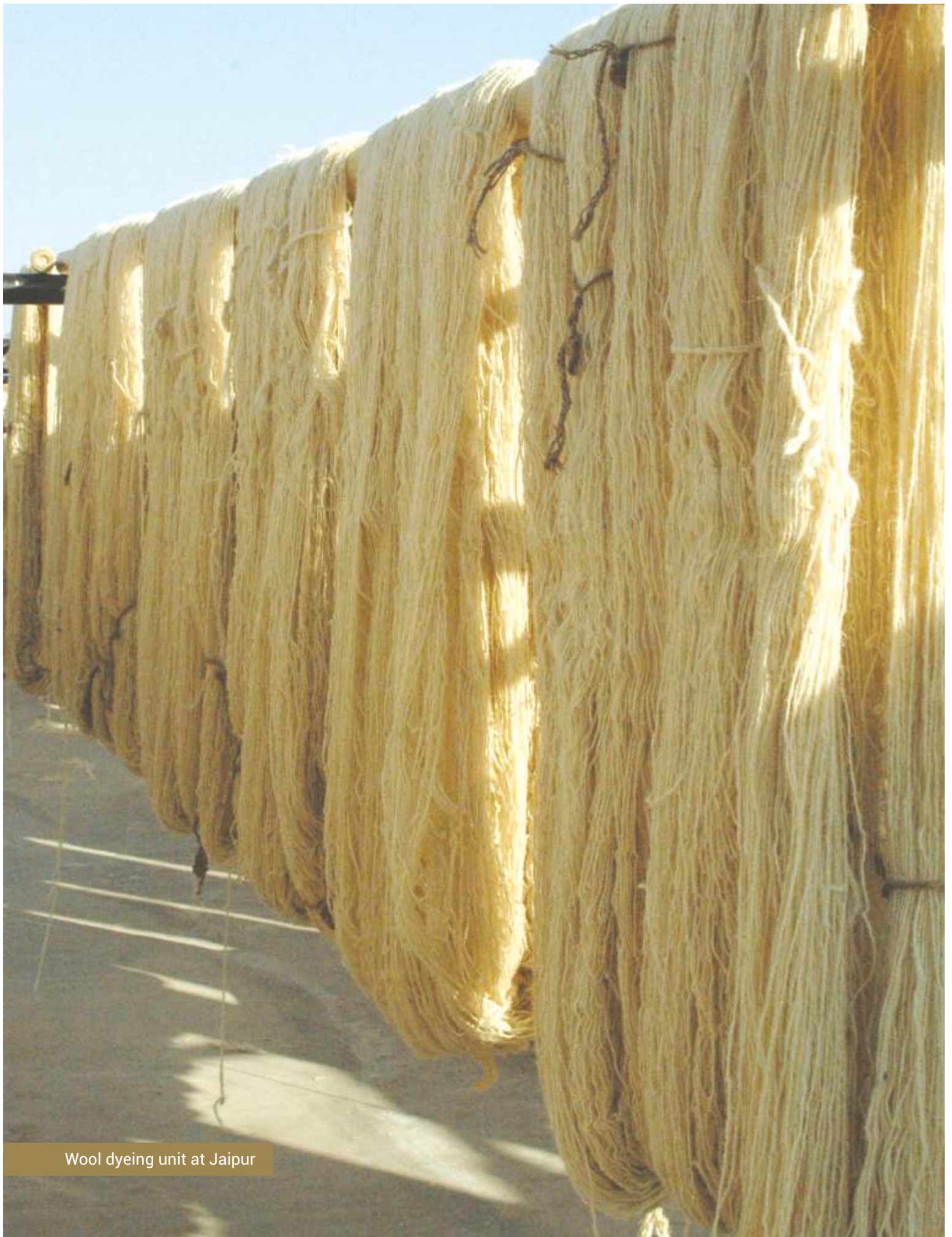
Wool dyeing unit at Jaipur