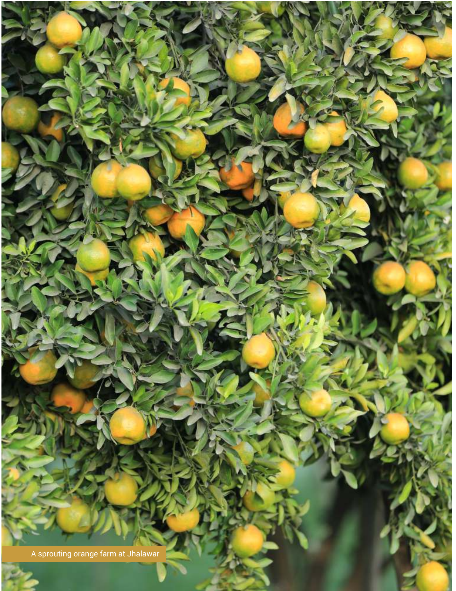
A sprouting orange farm at Jhalawar