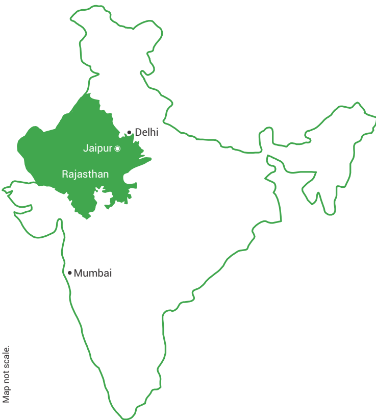
Map not scale.

RAJASTHAN HAS 14% OF INDIA'S CULTIVABLE LAND, WHICH ACCOUNTS FOR 25.55 MN HECTARES