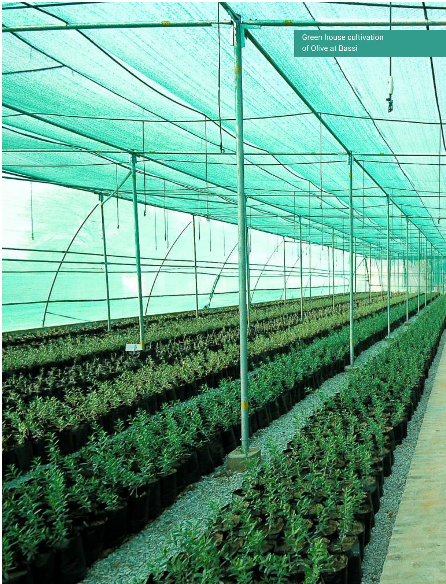
Green house cultivation of Olive at Bassi